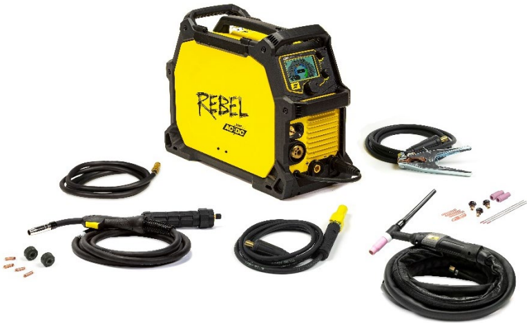
Rebel EMP 205ic AC/DC and accessories.

We made the impossible possible with the first-ever portable, all-process machine, complete with MIG, Flux-Cored, MMA, DC TIG, and now AC TIG capabilities, which means – yes – it TIG welds aluminium. It is a TRUE all-in-one welding system that delivers best-in-class performance in each process in the most portable, durable, go anywhere, weld anything industrial package on the market today.