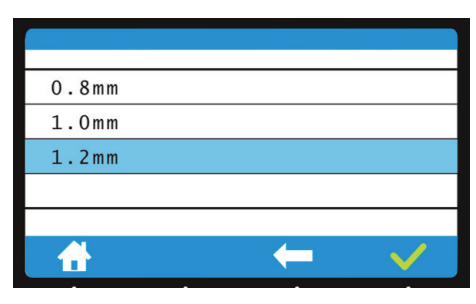
Step 4: Select your wire diameter