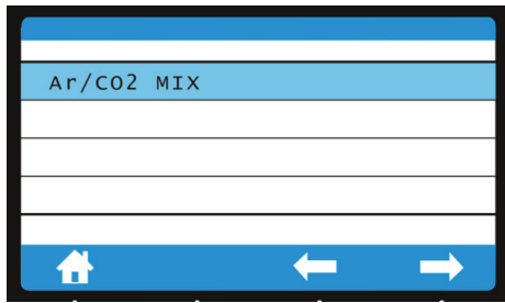
Step 3: Select your gas mixture